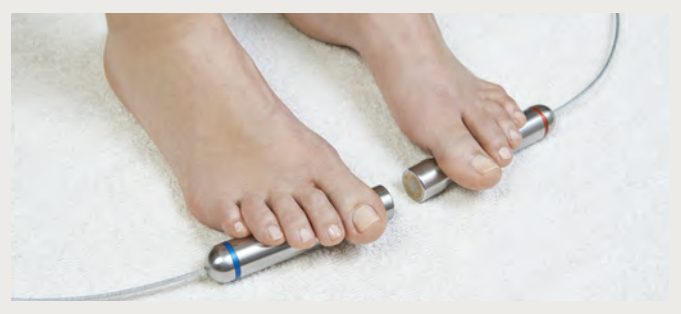
Place the red handle under your left foot and the blue handle under your right foot (see photo on page 14).